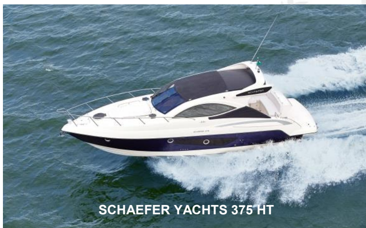
SCHAEFER YACHTS 375 HT

YACHT Solutions Fractional boating has a membership option that would depend on your usage, from daily use to a week at a time. Typically, busy people like you find time to use their boats just a few times per month. Perhaps you'd like to go for a relaxing evening cruise after work to unwind or maybe you'd like to take your family or friends out for a weekend adventure to Niagara on the Lake. YACHT Solutions uses a web-based, real-time scheduling system to easily and conveniently plan your cruising times for the months ahead. The Scheduler shows available times and you choose which dates are convenient for you and your busy schedule. The Scheduler updates in real time as each time slot is filled. Thus as a User, you are able to access the schedule at a time.